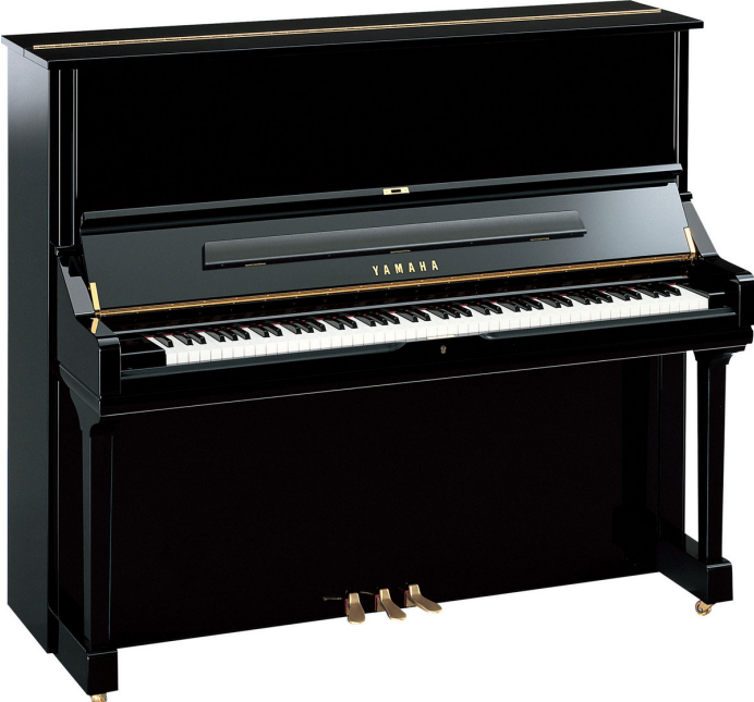
Upright piano and bench